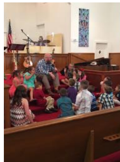
Children's Ministry at London Baptist