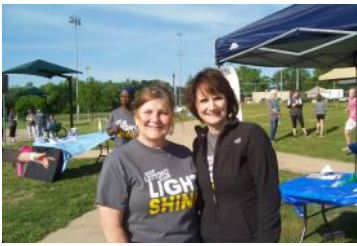
Son Shine Lighthouse Ladies and family members enjoyed a beautiful day out at Fair Park with Ebenezer Baptist Church sponsoring the 1st Annual Resurrection 5K and Fun Run benefitting our ministry.