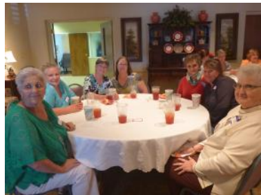
Mother's Day Luncheon FUMC Henderson