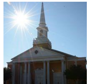
First Baptist Church Henderson