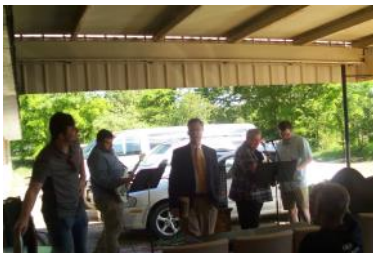
FBC Henderson Work Day at the Lighthouse followed by an evening of Praise and Worship