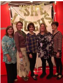
"She Laughs" Conference FBC Henderson